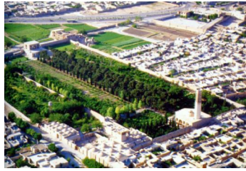
Figure 4. Dolatabad garden in Yazd

Generally, two right axes divide gardens to four main parts and buildings have a dock house in the center. The gardens, which are designed in aslant lands generally, have a main axe and a summerhouse in the last part, and the minor paths are cut by right angles and transversely. The garden is divided to four main parts, which are mostly square, or square like rectangles that they are divided to four other squares and this division continues according to the total area of the land. The main axe of the garden mostly is for decoration. The other parts are covered with fruit trees. As the area of the land increases, more fruit trees are planted in direct lines in the gardens. Every part of the garden is allocated to one type of fruit and good smelling flowers such as rose and damask roses are planted beside the water paths. Shading trees are planted in marginal line of the axes which divide the internal parts and create paths (alleys).