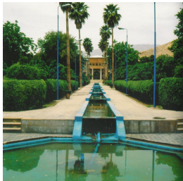
Figure 5. Fin garden in Kashan, Iran

Generally, two right axes divide gardens to four main parts and buildings have a dock house in the center. The gardens, which are designed in aslant lands generally, have a main axe and a summerhouse in the last part, and the minor paths are cut by right angles and transversely. The garden is divided to four main parts, which are mostly square, or square like rectangles that they are divided to four other squares and this division continues according to the total area of the land. The main axe of the garden mostly is for decoration. The other parts are covered with fruit trees. As the area of the land increases, more fruit trees are planted in direct lines in the gardens. Every part of the garden is allocated to one type of fruit and good smelling flowers such as rose and damask roses are planted beside the water paths. Shading trees are planted in marginal line of the axes which divide the internal parts and create paths (alleys).