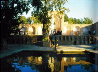
Figure 3. Ghadamgah in Neishabour (Mazar garden)