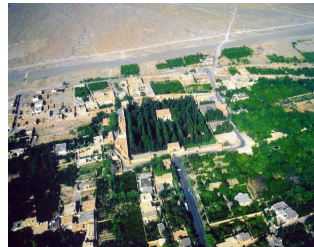
Figure 6. Delgosha garden in Shiraz, Iran

Water illustrations were exaggerated in designing the gardens since Iran is a dry land with low water. The dock mostly is built in big dimensions. Besides the paths, mostly there are water docks and streams to illustrate the water better or to have more sounds and movements of the water. These minor streams have right angles with the main stream or are in parallel position to them. The entrance of the garden is very important according to the ancient architectural tradition of Iran and if there was not any transom because of the little size of the garden, a wall was built behind the transom, which was called Oros and prevented the others to look into the garden. Behind the transom or Oros there was a place which shading trees were planted there and it was covered with carpets for accepting the guests. Sometimes there was a dock there, either and it was called Bonehgah [14].