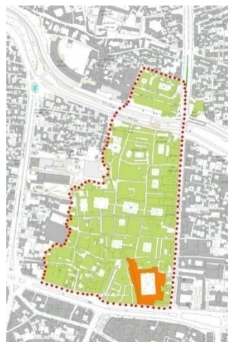
Figure 1: Bazaar of Tabriz region

Amir Sara and Timcheh complex is located in most southern part of bazaar of Tabriz confined to gold bazaar ( Bazaar of Amir)in west, shoe makers bazaar in north, Modares street in east and Jomhuri street in south ( Ganjnameh, encyclopedia of Islamic architecture works of Iran: bazaar buildings,2005){1}