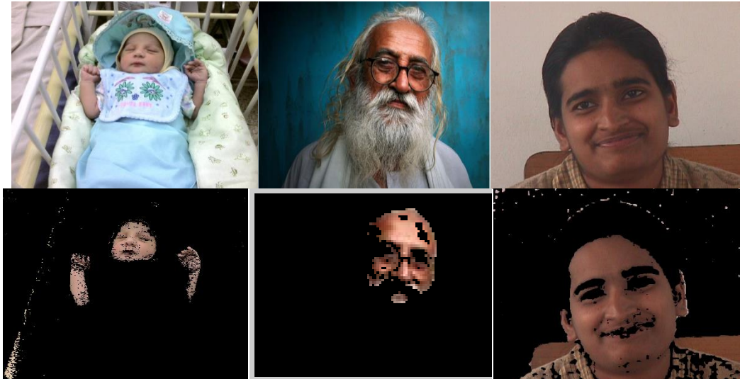
Figure 3. Sample output images of HSV based technique

In table 5, I have presented matlab code presented in [5] and after testing with different skin image sets HSV based approach outperformed as compared to YUV based approach for sub-continent skin type. Improvement in skin detection filters is required to detect Pakistani and indian skin as results are shown in figure 3.