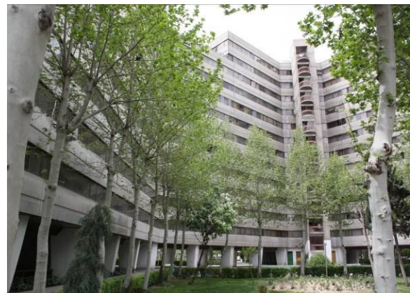
Fig. 4 and 5, Ekbatan residential Complex, Tehran