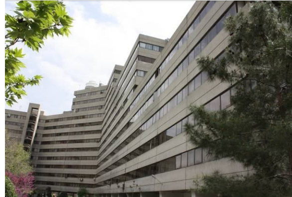
Fig. 2 and 3, Ekbatan residential Complex, Tehran

Ekbatan was, and still is considered a great achievement in modern residential typology in Iran, although it has several negative characters. Its plan contains and compresses diverse types of separate units in a building into the compact yet sufficient form of the building type and achieves the desired density. What results, though, are diverse residential units but poor lighting into the central corridor and the depths of the larger units themselves, and poor proportions of width and length in some units. In spite of preplanned diversity, the spaces of the building are categorized as repetitious. This repetitive typology does facilitate variance in plan to accommodate several different unit types and respond to different personal requirements. Ekbatan is considered a relatively successful example of early residential complexes in Iran. From an architectural point of view, it is also a forerunner in introduction of minimalistic aspects of modernity to Iran.